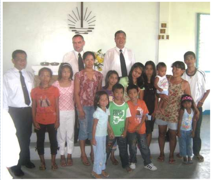
Ap. Wolf Sealed 13 Souls in Asan Sur Pangasinan October 10, 2010