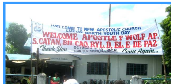
Luzon North Youth Day October 9-10, 2010