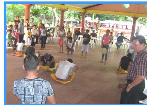
Luzon South Youth Day October 16-17, 2010